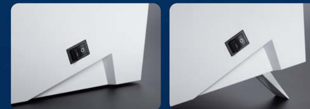
7 | 10° INCLINATION POSSIBLE