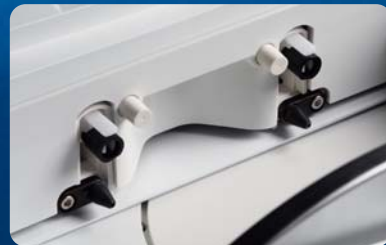
3 | ACCURATE, ADAPTABLE AND AUTOMATIC