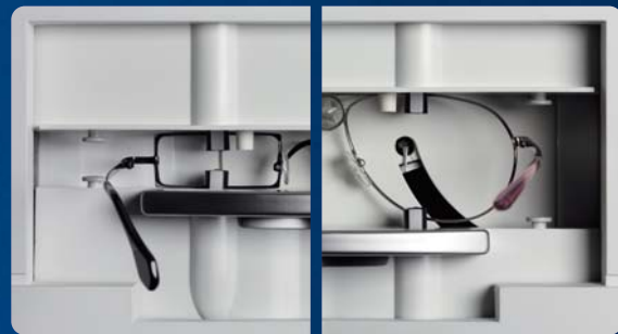
2 | TRACES THE SMALLEST AND BIGGEST FRAMES