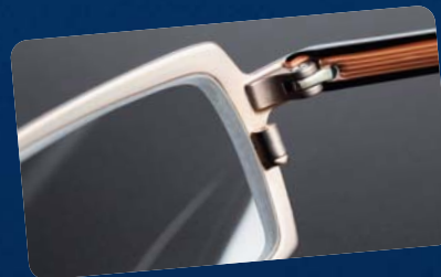
4 | PERFECT FIT OF THE LENS IN THE FRAME

A tool you can count on, right now and for many years to come