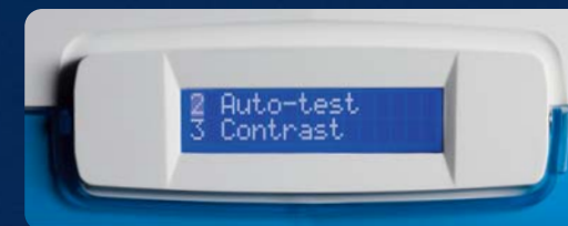
8 | DIGITAL KEYPAD + DIGITAL DISPLAY