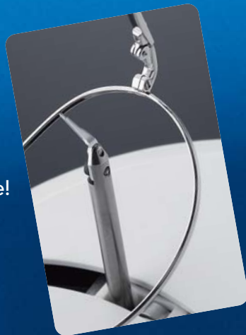
1 | INCLINED TRACING HEAD